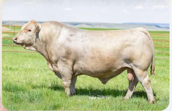
OW Lead Time (P) sire of lot 15.