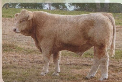
Palgrove Eclipse (P) (R/F) sire of lot 30