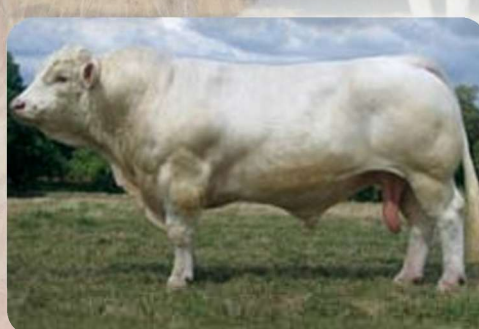
Pinay (FF) sire of lots 64 & 65