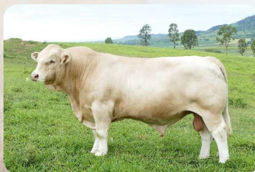
Glenlea Quartermaster (P) (R/F) sire of lots 27, 29 & 41