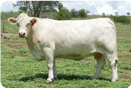
Charnelle Friesia 5 (PP) GKA H41E dam of lots 33, 34 & 42.

Many Thanks to Nutrien Ag Solutions Toogoolawah for their continued support again this year sponsoring the Buyers of the Top Priced Bull and the Volume Buyer with 2 x 5L Moximax Pour-On.!