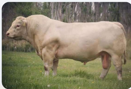
Silverstream National (PP) sire of lots 28, 46 & 47

Cooranga Charolais would firstly like to thank the Coolabunia Classic Committee on the invitation to present Bulls to the sale. We as a family established Cooranga Charolais Stud in 1994 and then from there grew and developed to produce Bulls focusing on low birth weight, high growth rate with finishing attributes to fit all carcass specifications