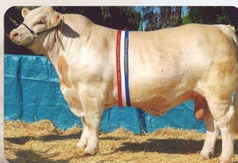
Advance Domino (P) sire of lots 21 & 24