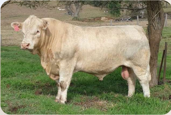
Cassaglen Raptor (P) sire of lots 8, 9, 10 & 12.