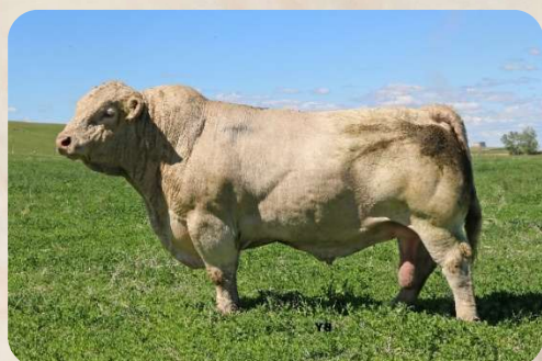
Elder's Blackjack (PP) sire of lots 19,20,22,23 & 63