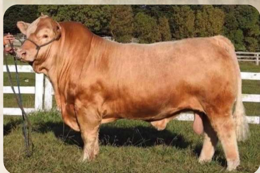
Waterford Neon Lights (P) (R/F) sire of lot 31