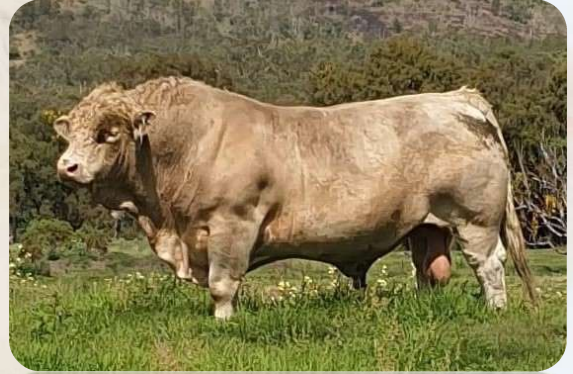
Palgrove Nebraska (P) sire of lots 16, 17, 54, 57 & 59.