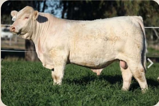
Ascot Rafferty (PP) sire of lots 7, 11, 13, 14, 18, 55, 56 & 58.