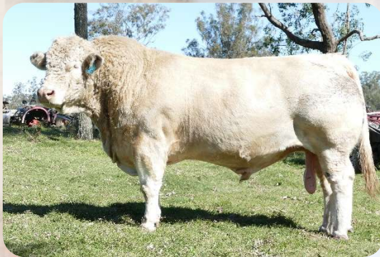
Charnelle Portland (P) sire of lot 48