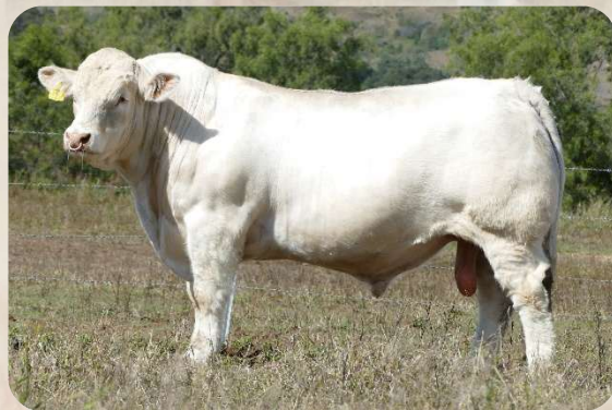
Charnelle President (P/S) sire of lot 5