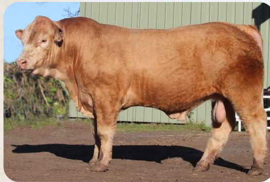
Black Duck Rough Justice (PP) (R/F) sire of lots 6 & 49