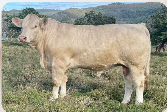
Charnelle Rory (P) sire of lots 1 – 4, 37, 50 & 51