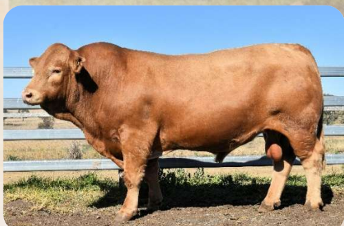
Reids Rocky (P) (R/F) sire of lots 25 & 61